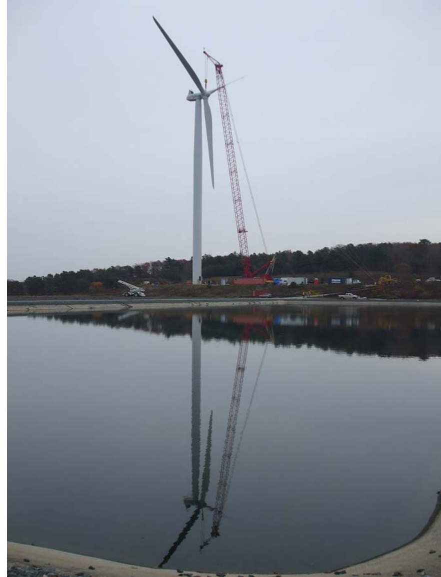
Actual Photo of 1.65 MW Vestas turbine installed on 11/10 at the Falmouth WWTF