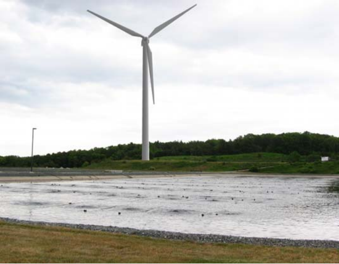
Simulated photo of 1.65 megawatt Vestas wind turbine at the wastewater treatment facility